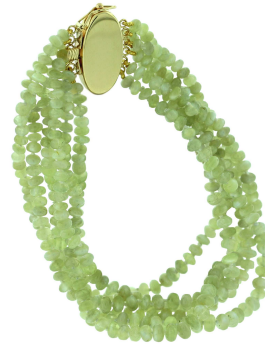
Five Strand Chrysoberyl Cats Eye Bead Bracelet