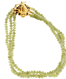
Three Strand Chrysoberyl Cats Eye Bead bracelet. 18k Frog clasp.