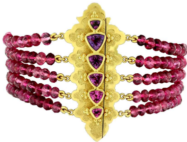
This sumptuous bracelet is at once elegant and sexy. The fabulous suite of lavender Sapphires is graduated in both size and color and the beautifully matched collection of high grade tourmaline bead strands can be tailored to fit, bringing a sense of grace and beauty to the wearer. The opulent clasp displays the meticulous craftsmanship typical of Crevozhay designs. ~18K yellow gold clasp bracelet with Sapphire (6) = 3.71 cts. "H", 5 strands of Tourmaline beads = 276.57 cts. "H". Couture Collection.